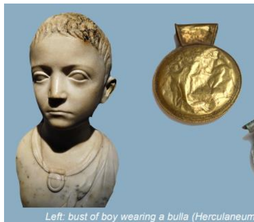
Left: bust of boy wearing a bulla (Herculaneum)